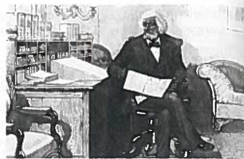
American orator, editor, author, abolitionist, and former enslaved person Frederick Douglass (1818–1895) edits a journal at his desk, late 1870s.